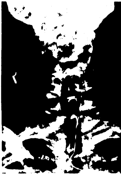
Fig 2.—Roentgenogram showing localization of catheter in cervical (C-6) region (case 2).